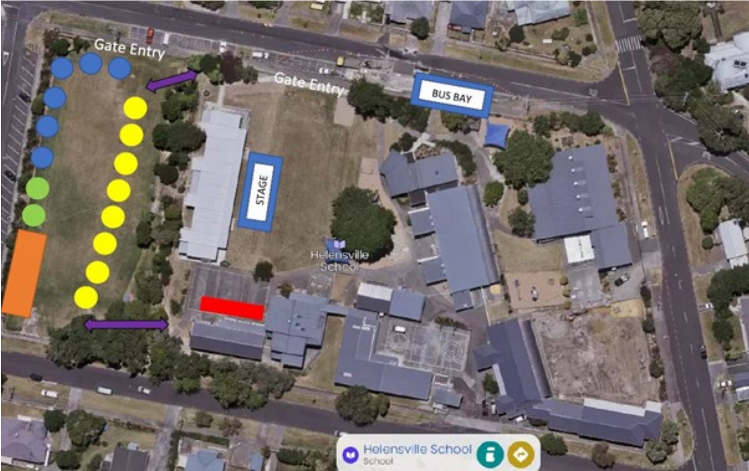
Helensville Primary School - 29 Rata Street, Helensville.